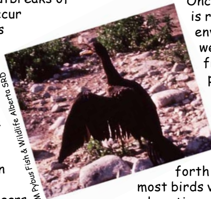
M. Pybus Fish & Wildlife Alberta GRD

A wide range of wild birds throughout the world can provide suitable habitat for NDV. However, the relationship generally is quite benign and the birds are no worse for sheltering (hosting) the virus. Nervous tissue, particularly the brain and spinal cord, offers the optimum environment for NDV survival. Under certain conditions, the virus population can build in the nerve tissues and individual birds die. Outbreaks of noticeable mortality occur occasionally in colonies of cormorants, pelicans, and gulls. In these situations, damage to the nervous tissue is seen as partial paralysis of the wings and legs. Often there is loss of control of the wing and foot on one side of the body while the other side appears normal. The affected wing may be held away from the bird's body or may hang limp and useless. Such birds obviously cannot fly. The affected foot may have the toes tightly clenched and, when walking, the bird limps or falls over. On the water, such birds are unable to lift off or to dive and often swim in circles. Sick birds often are weak and unable to avoid humans.