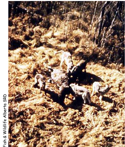
Fish & Wildlife Alberta SRD

Adult tapeworms cause little or no damage to wolves, coyotes, or dogs. There is likely some minor irritation of the gut wall but nothing that interferes with overall health of infected animals. Similarly, hydatid cysts in moose and elk grow slowly and do not cause much damage. However, when many cysts occur in the lung tissues, individuals likely have decreased stamina and may be more susceptible to predation from wolves. This actually works in favour of the tapeworm completing its life cycle.