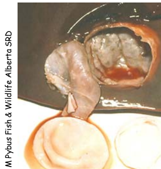
M. Pybus Fish & Wildlife Alberta SRD

In general, this tapeworm is a resident wherever wolves occur in the province. The hydatid population is well established since adults occur in a high percentage of wolves. Hunters often see cysts in the lungs of moose and elk in areas where wolves occur. This tapeworm also occurs in Elk Island National Park and in the Cypress Hills, where there are a lot of coyotes, but no wolves. Coyotes are marginal habitat for hydatid tapeworm, however, they can provide enough resources to maintain a limited population of adult worms. Dogs that eat infected lungs are likely to provide habitat for the tapeworms. No one has looked for this in dogs in Alberta. Infected dogs could be a human health risk (see below).