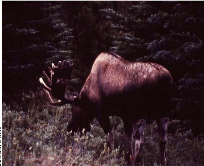
Karvonen Films Ltd

We all know that sometimes dogs are soiled with faeces on their hair (some even roll in the stuff!). In addition, faeces from an infected dog could contaminate the backyard, particularly the sandbox, with many tapeworm eggs. Humans, certainly children, can end up eating the eggs after close and sometimes unsanitary association with dogs.